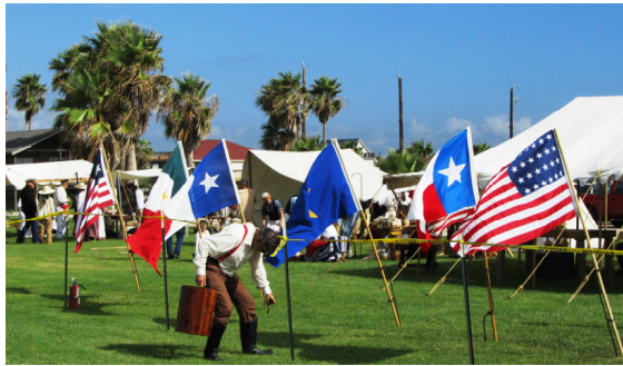
Celebration and artillery workshop held at Surfside, Texas; on 20 September, 2014 for Texas Navy Day.