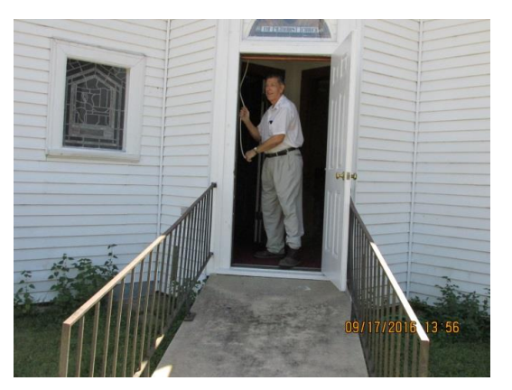
Bells Across America - Louise , Texas