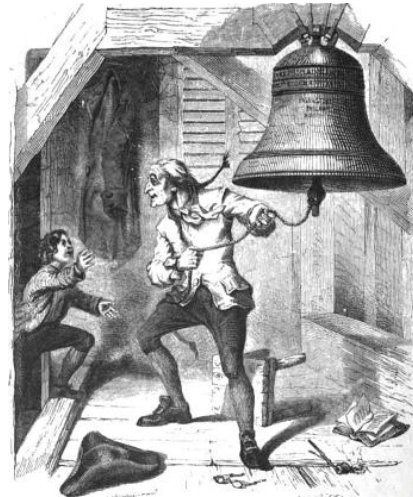
Graham's Magazine, June 1854