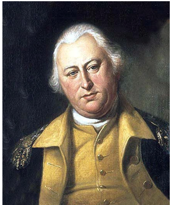
General Benjamin Lincoln, Painting by Charles Willson Peale

Lincoln surrendered the city and his force of 6,000 men, after what one British officer called "a gallant defense." The British occupied Charleston for more than 2 1/2 years, evacuating Dec. 14, 1782.