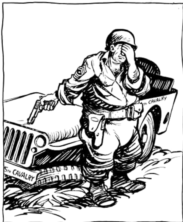
By Bill Mauldin -From "Bill Mauldin's Army"