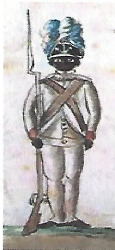
African American Revolutionary Soldier