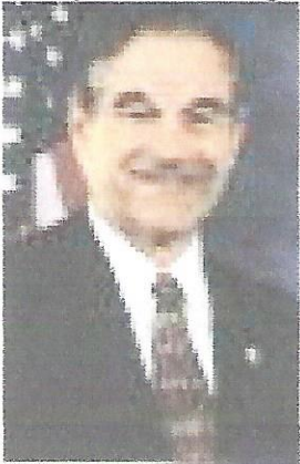
Representative Ron Paul