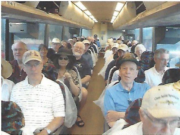
Historical Tour BOM Meeting, Lake Jackson, Texas