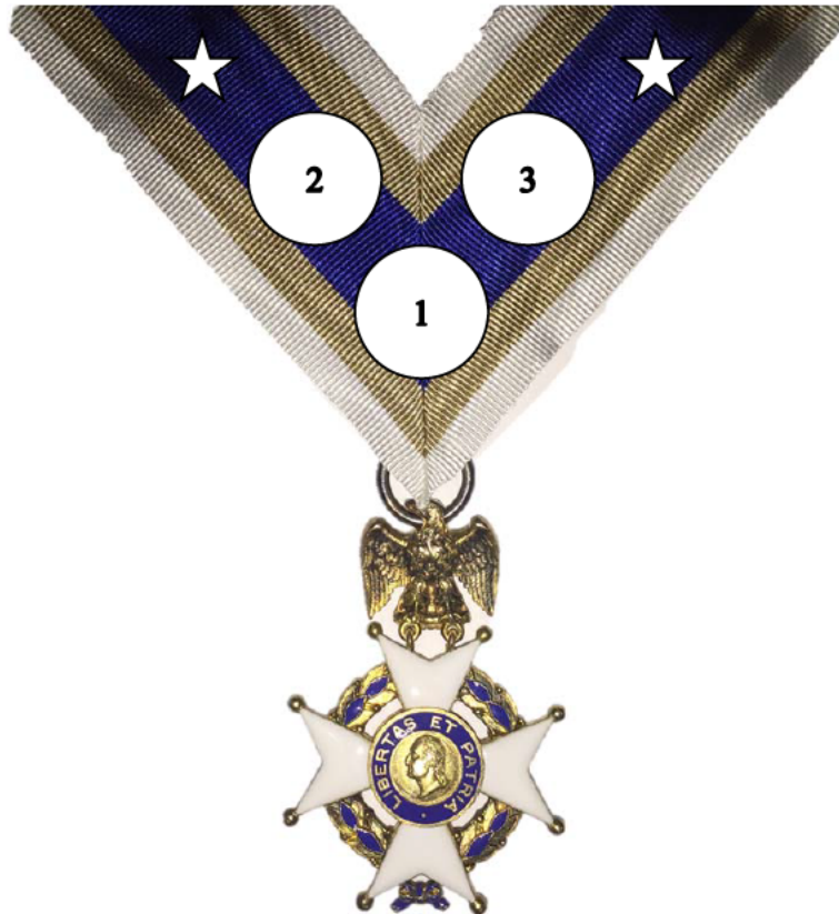
Figure 1. Placement of pins on SAR Neck Ribbon when facing wearer.