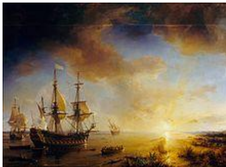
La Salle's Expedition to Louisiana By Jean Antoine Théodore de Gudin, 1844