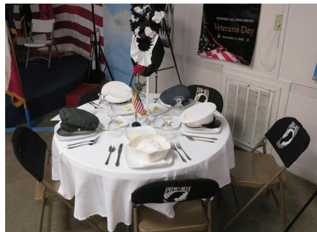
Table set for POW/MIAs, who never came home.