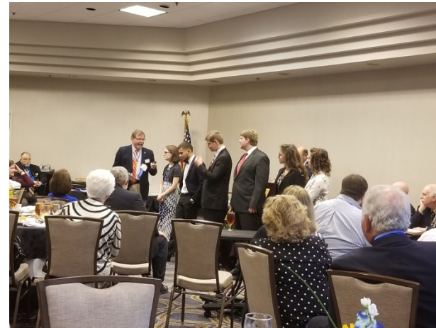
Figure 8. Oration contest competitors