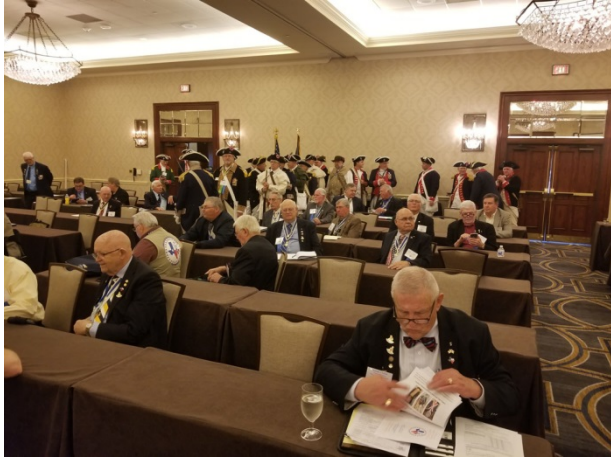
Figure 5. 1 st General Session