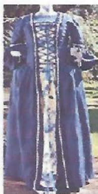
Cotton Day Dress