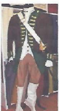
1 st . Cont. Dragoons