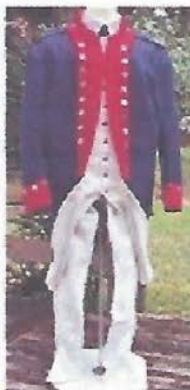
2 nd South Carolina