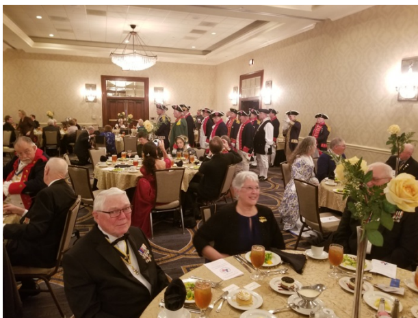
Figure 9. Color Guard kicks off Gala Banquet