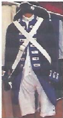
2 nd Virginia Regt.

Stop by my table during the 124 th Texas SAR Convention and let's discuss a Rev. War uniform or ladies' gown for YOU.