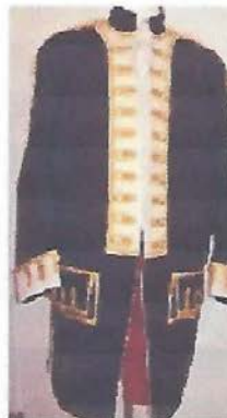
US Naval Officer 1779