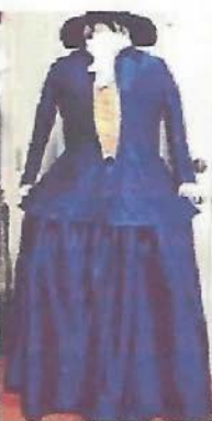
Silk Riding Habit