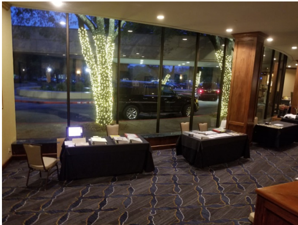
Figure 7. All YEARBOOK competitors