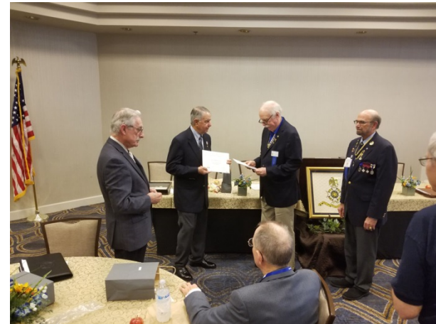
Figure 4. Induction of Gen. Joe Ashy into TX SAR