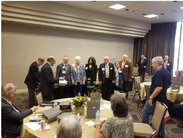
Figure 3. Silver Good Citizenship awards