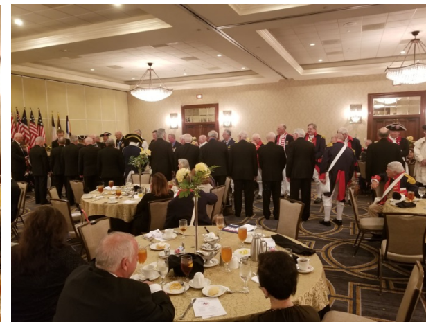
Figure 10. Patriot Awardees congratulated