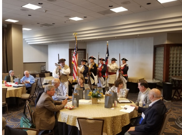
Figure 2. Color guard at box lunch awards