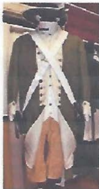
US Marine 1775