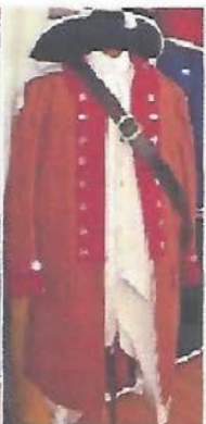
Militia Officer 1775