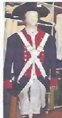
Hall's Regt. 1776