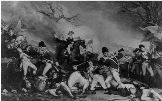
Painting by John Trumbull

“Washington’s victory at Princeton on January 3, 1777, like that at Trenton a week earlier, heightened the morale of the American Army as well as that of the citizens, and strengthened the reputation and authority of Washington himself. The twin victories of Trenton and Princeton came at a time when the spirits of the American people had reached a dangerously low ebb, when another defeat might have been fatal to the cause of independence. The situation brightened with these successes at the year’s end, and from every corner militiamen flocked to the colors. A new Continental Army emerged.”