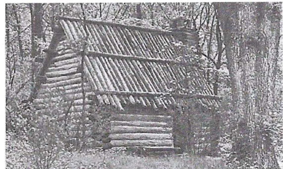
1940 NPS Guide Book

In November of 1779 General George Washington picked Morristown, New Jersey as the winter encampment for the main part of his army. This is where Washington began the process of inoculation of soldiers and local civilians against small-pox.