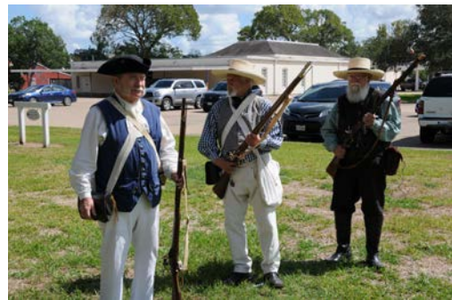
Brazoria Historical Militia members