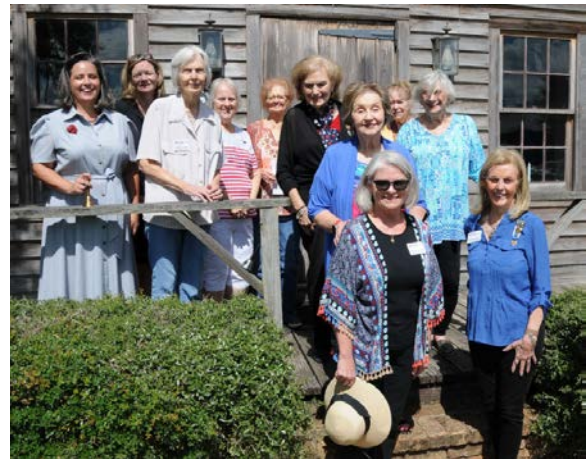
Asa Underwood DAR and speakers