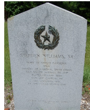
1936 Texas Centennial Marker located in Jasper, Texas, in Jasper County.